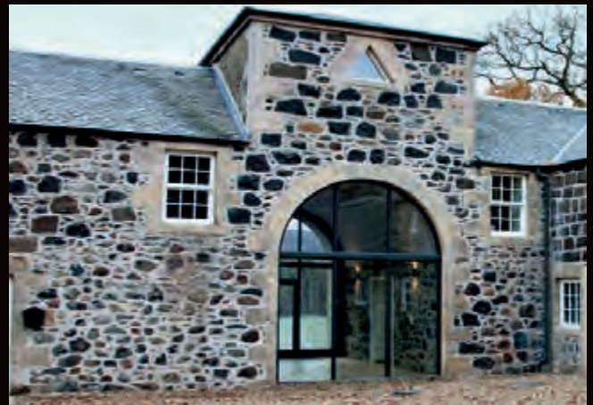
Project Monitoring of £3million development for client Goldentree at the Gartur Estate