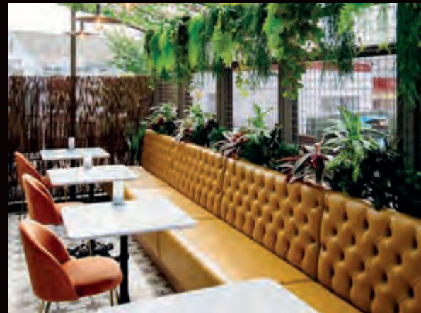
Mr MacGregor's, glasgow