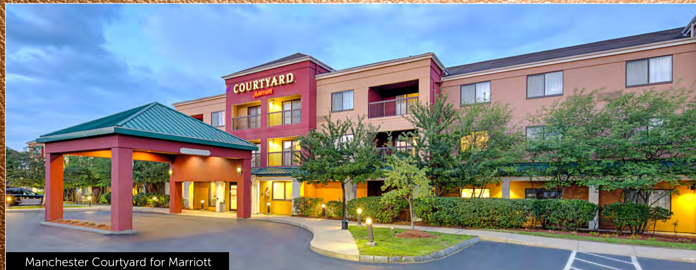
Manchester Courtyard for Marriott