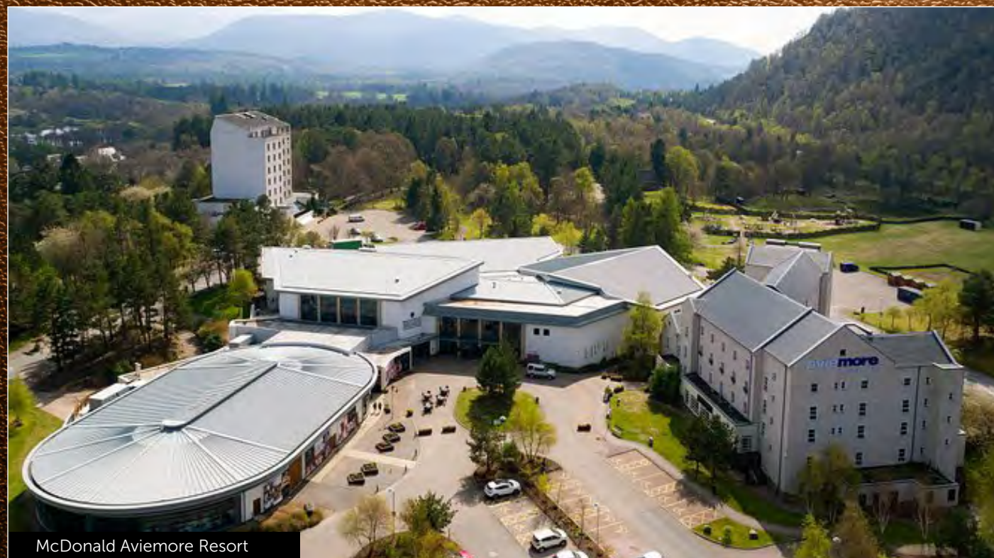
McDonald Aviemore Resort